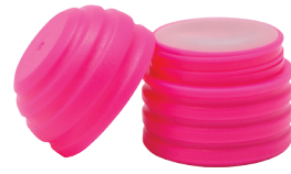
mini push ups 4g

“OraLabs Lip Balm is tested and proven to help in the prevention of dry, chapped and wind burned lips. Order from available in stock items or create your own custom formula (All Naturals & SPF options available).”