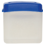
mini pet pot 7g