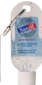
1.5 oz. with Carabiner