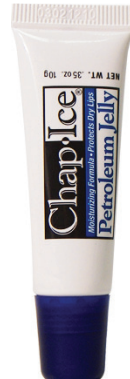
squeeze tube 10g