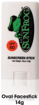
Oval Facestick 14g

OraLabs Sun Care Products are tested and proven to protect against harmful UV rays which can lead to skin cancer. Order from available in stock items or create your own custom formula. Ask about custom containers and packaging.