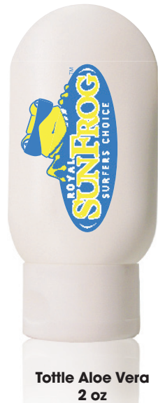
Tottle Aloe Vera 2 oz