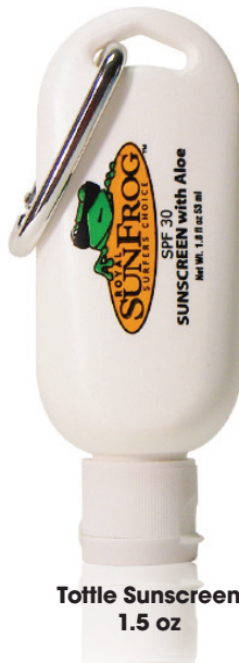
Tottle Sunscreen 1.5 oz